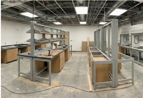
Laboratory Tables & Cabinets

We specialize in designing and executing laboratories for R&D centers, pharmaceutical units, educational institutions, and industrial facilities, ensuring strict adherence to safety, quality, and regulatory standards. Our turnkey scope includes pollution control systems, HVAC & exhaust systems, gas distribution, electrical & plumbing works, laboratory furniture, ducting, and customized stainless-steel fabrication.