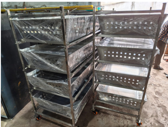
Guinea Pig Cage with Racks

Precision-fabricated stainless steel cages designed for hygienic, safe, and compliant animal housing in pharmaceutical and research facilities.