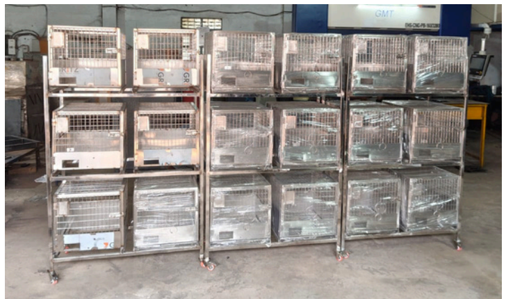
Rabbit Cage with Racks